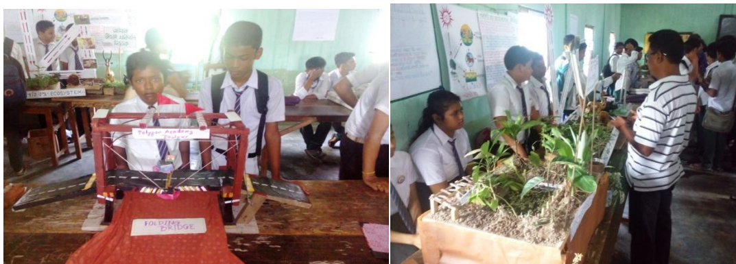
(Photographs of Aryabhata Science Centre Annual Programme)