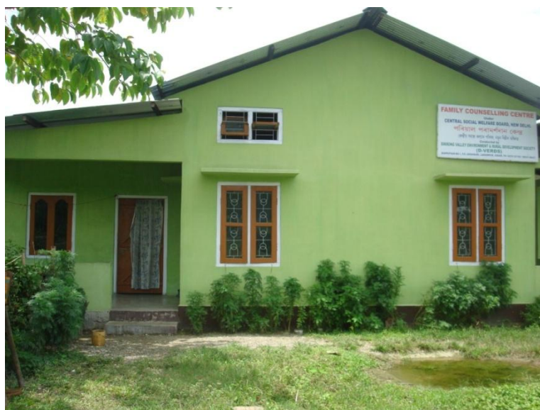
(A view of Office Building of D-VERDS)

Dikrong Valley Environment & Rural Development Society has provided Rs.12,000/- to the different poor meritorious students as a support service from its own source i.e. donation of Swamdashani Foundation, Public donation etc.