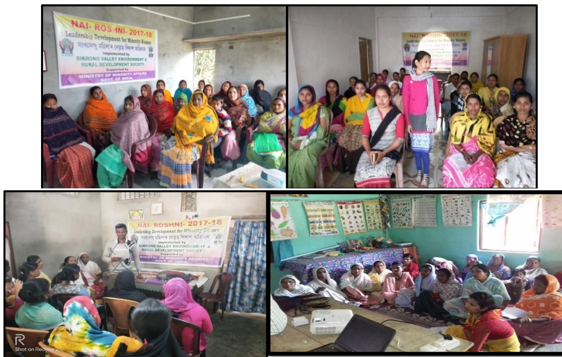
(Photographs during the Project Period)

Programme Details:- The Project of Half Way Home is established under Deendayal Disable Rehabilitation Scheme (DDRS) of the Ministry at North Lakhimpur, Dist. Lakhimpur, Assam sponsored by the Ministry of Social Justice & Empowerment, Govt. of India for psycho-social rehabilitation of treated and controlled mentally ill persons. Presently 9 Nos. of beneficiaries are rehabilitated in the home and 15 Nos. of beneficiaries have left the home after completion of 6 months.