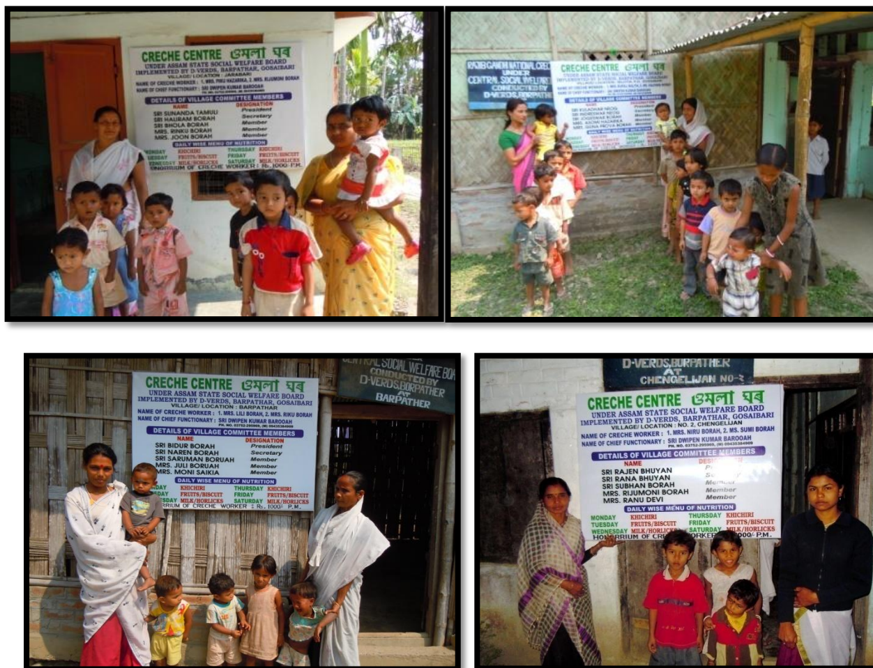
(Different moment of Crèche Centres)

Detail Location: 1. Barpathar; 2. Jarabari; 3. Bilotia; 4. Chengeljan;