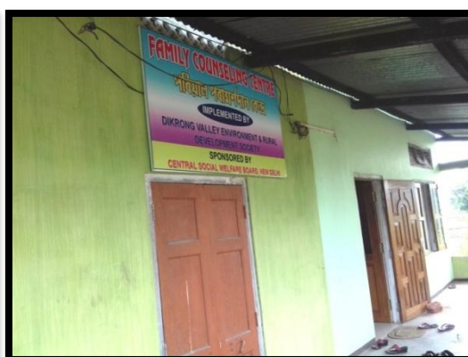
(The Family Counseling Centre (FCC))